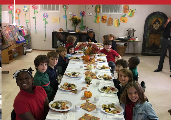
MISS SPIDER'S TEA PARTY