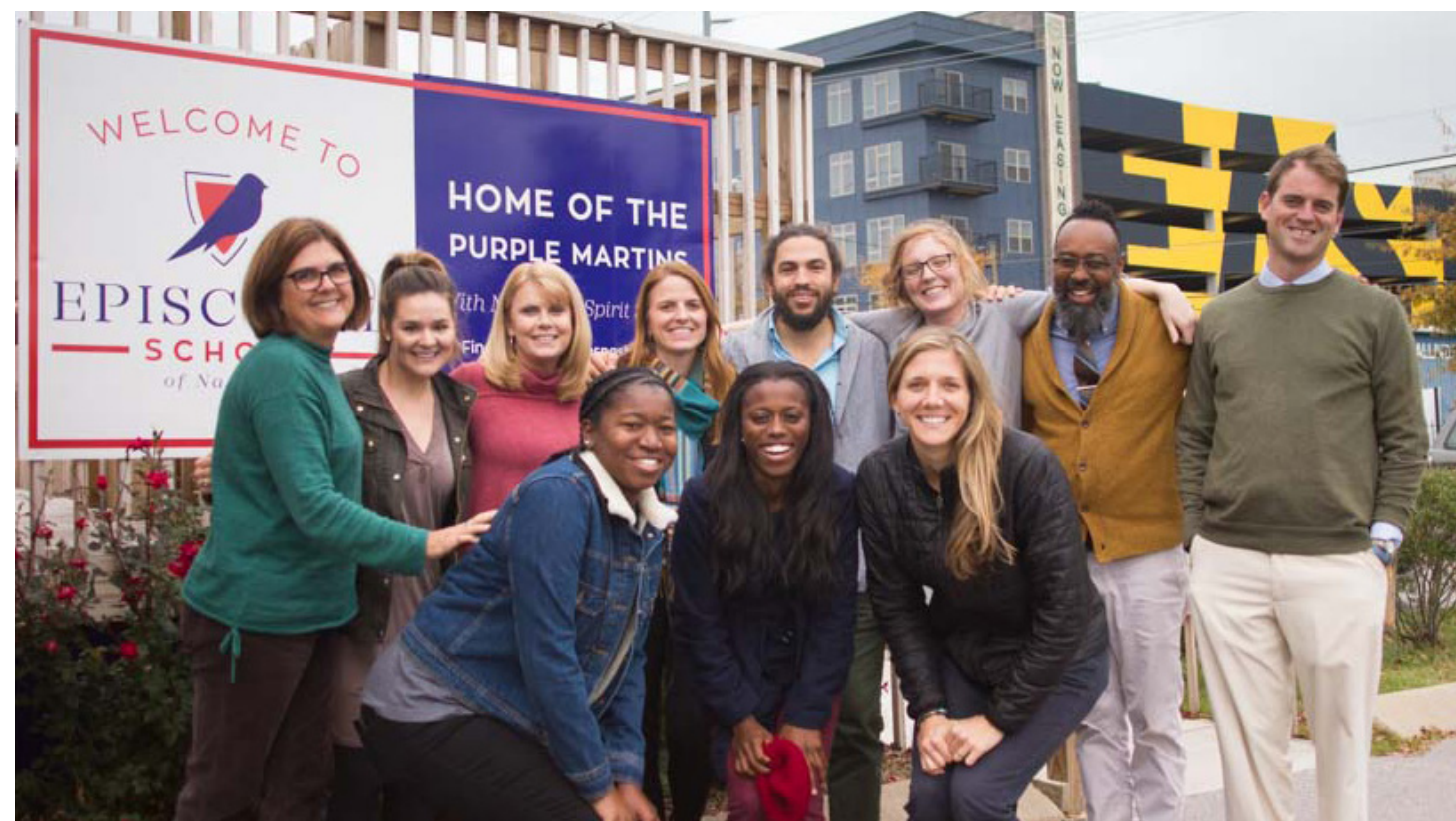
Faculty Year Two, 2017 - 2018